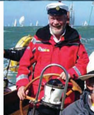
Top: Off the Needles Above: Sir Robin Knox-Johnston at the helm of Sceptre in 2008