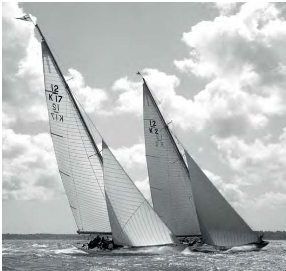
BEKEN OF COWES