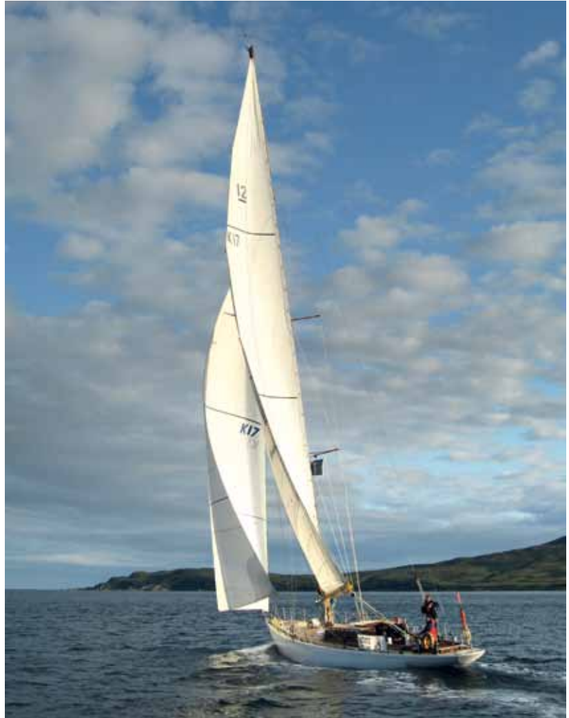
Above: Maintenance on Sceptre , including the return of the missing counter Right: Sailing off Islay

guide to sail selection is that “she likes to have her lee rail in the water.” Soon the wind moderated again and Sceptre powered towards Port Ellen on Islay - famous for its eight distilleries – where we moored up alongside a fishing boat in the early evening.