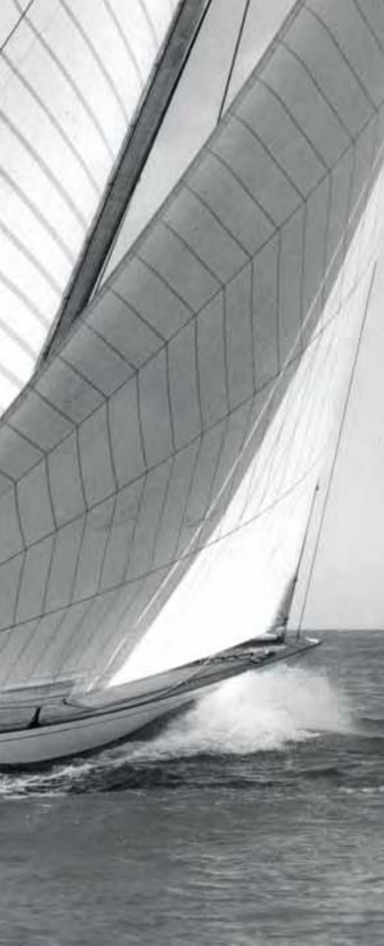
Left: Sceptre off Cowes. Below: In trials with Evaine off Cowes, 1958