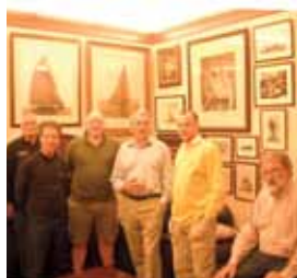
Sceptre's crew visit the Royal Ulster Yacht Club